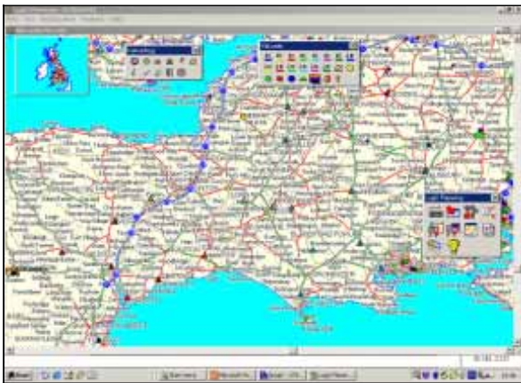
DPS ensured accuracy of scheduling by special map development.

The method of use has been refined to allow for daily or alternate day scheduling of collections, and to cope with seasonal variations in milk yield.