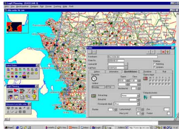
Detailed information is supplied with each transport order.

The second phase in development was to use WinLogiX together with FAS, which later was changed to Movex from Intenia. The implementation of Movex at Skånska Lantmännen allowed more information to be sent to PlanLogiX. The planner was presented with detailed information of the delivery presented in PlanLogiX route planning and optimisation system.