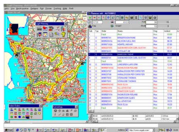
PlanLogiX allows detailed route planning.

In the end of the 90's Schenker BTL and Skånska Lantmännen formed LIAB , which is a joint venture company for distribution solutions to the agricultural industry sector. LIAB acquired the existing route planning and optimisation system and is now the user of the DPS solution.